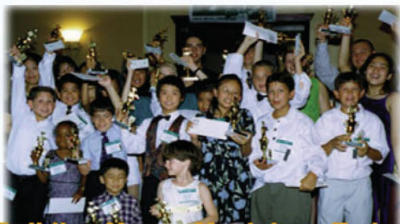
Building Young Musicians Today - For A Better Tommorrow

The first phase of the newly redesigned AGM website is now on line. It is bright and colorful and easy to navigate. It has a bright blue and orange color scheme and has easy navigation bars, one the runes horizontally across the top to take to you to the main sections: The sub navigation bar runs down the side and is in the shape of a piano keyboard.